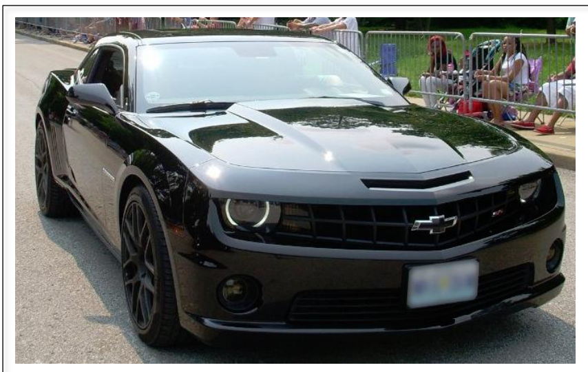
2011 Chevy Camaro SS2 "Night Fury"