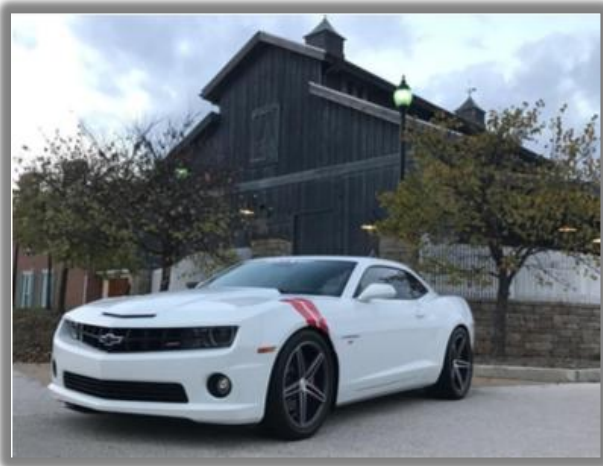
2010 Summit White SS "Marilyn"